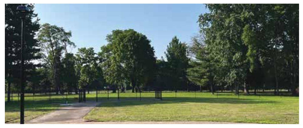
Be sure to check out the City website for more updates!

A dog park is coming to St. Francis! The City acquired the property at the southeast corner of Community Park. Construction began this summer and included tree removal, land clearing, and grading. The dog park includes fenced-in areas for small-breed dogs and a separate area for larger-breed dogs. There will be benches and a drinking fountain. The project should be completed by the fall of 2024. Parking and entrance to the dog park are located at the backside or East side of Community Park.